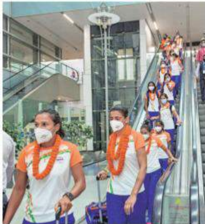
महिला हॉकी टीम के खिलाड़ी

संसद में भारतीय ओलंपिक खिलाड़ियों को दी गई बधाई