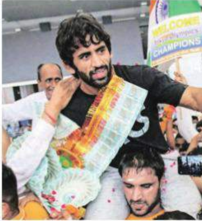
बजरंग पूनिया - कांस्य पदक विजेता