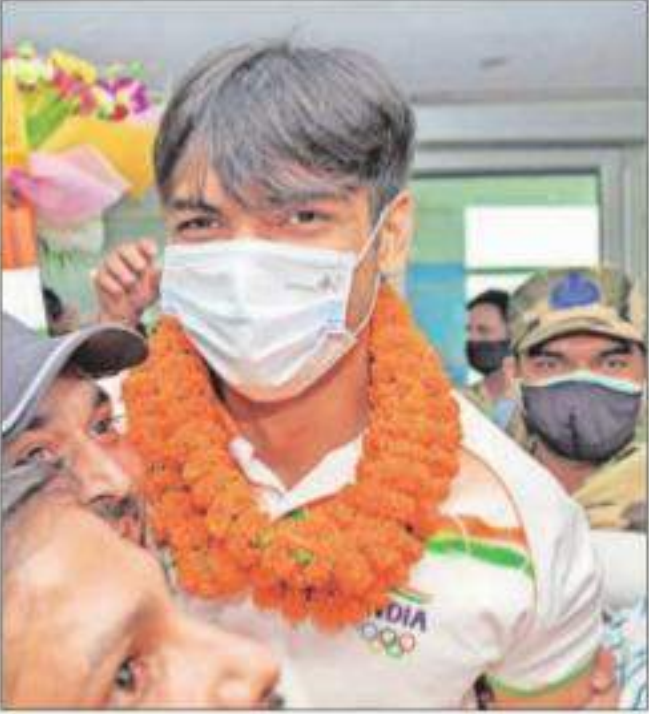
नीरज चोपड़ा - स्वर्ण पदक विजेता