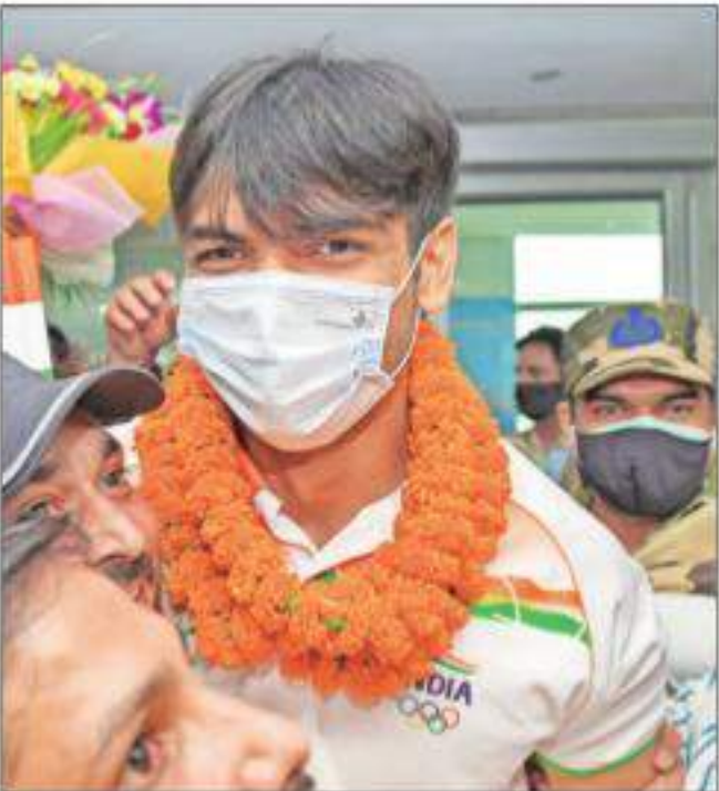
नीरज चोपड़ा - स्वर्ण पदक विजेता