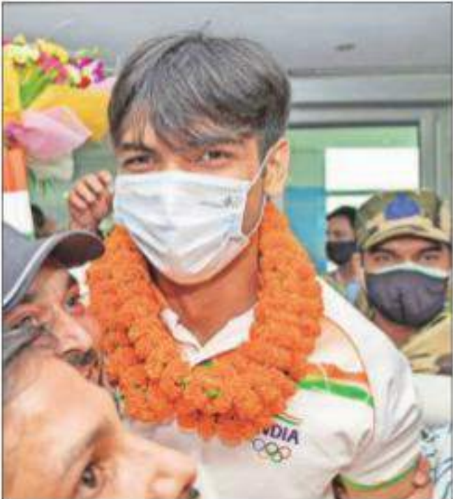
नीरज चोपड़ा - स्वर्ण पदक विजेता