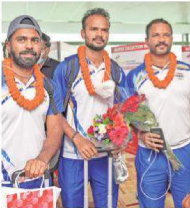
पुरुष हॉकी टीम के खिलाड़ी - कांस्य पदक