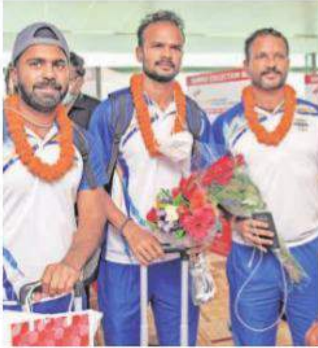
पुरुष हॉकी टीम के खिलाड़ी - कांस्य पदक