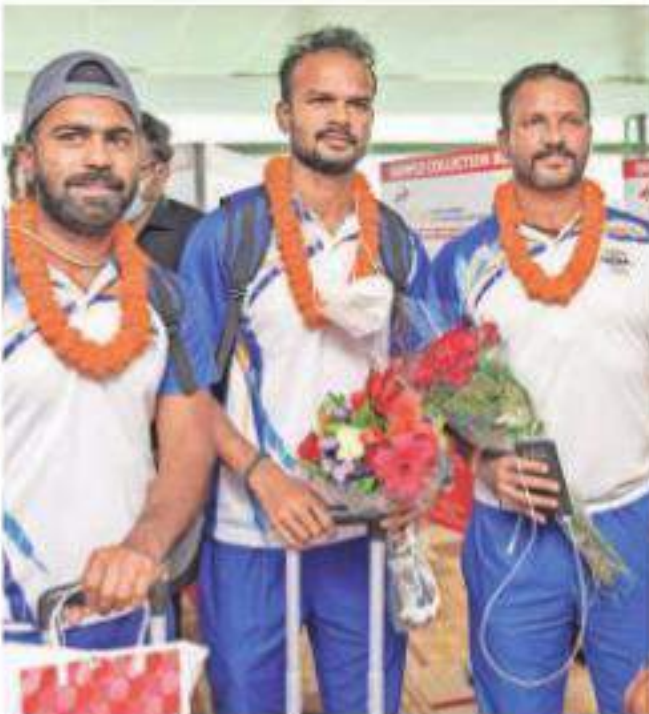
पुरुष हॉकी टीम के खिलाड़ी - कांस्य पदक