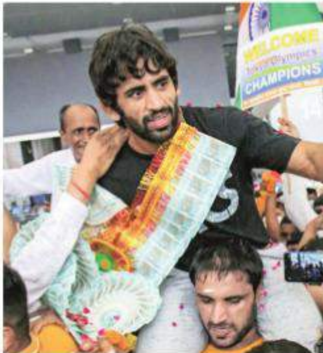
बजरंग पूनिया - कांस्य पदक विजेता