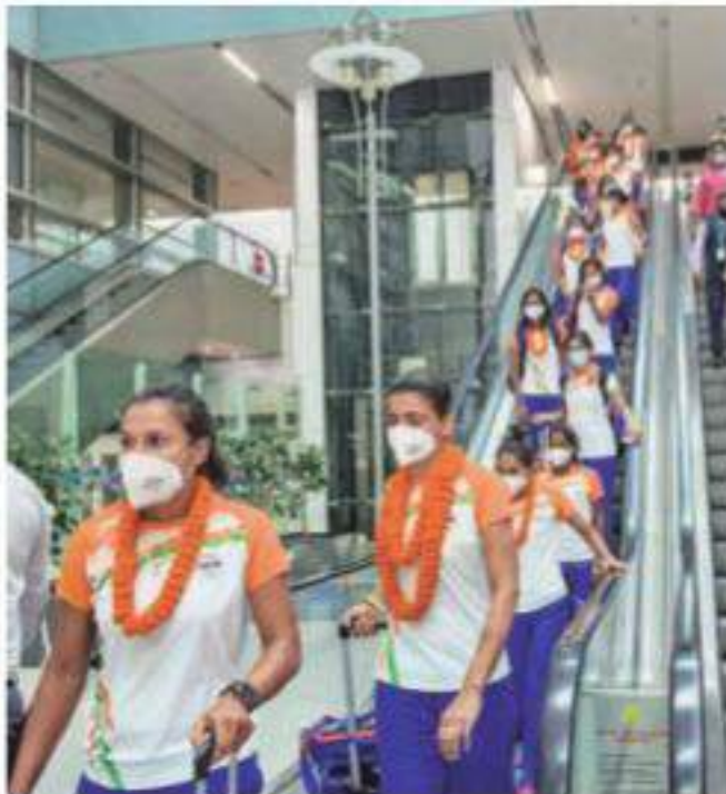
महिला हॉकी टीम की खिलाड़ी