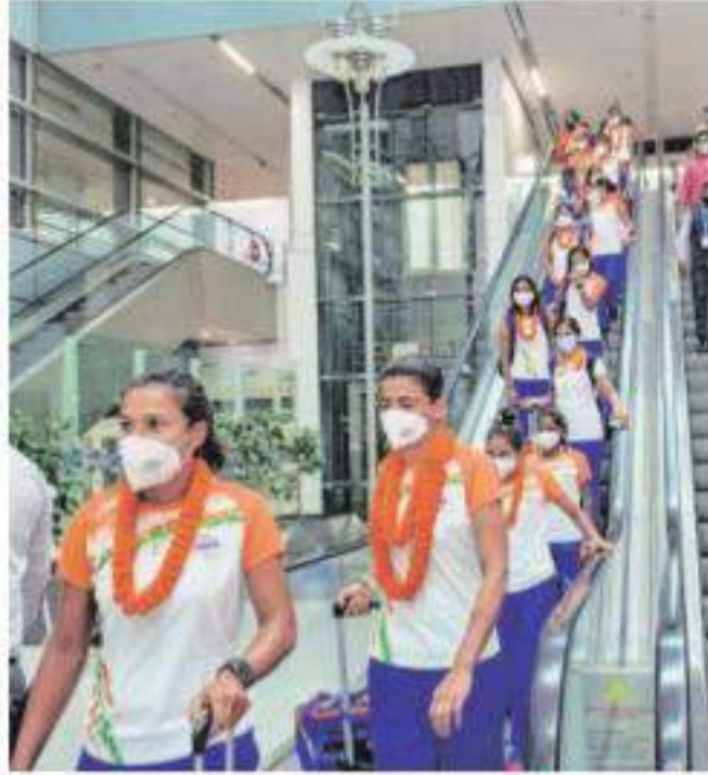
महिला हॉकी टीम के खिलाड़ी