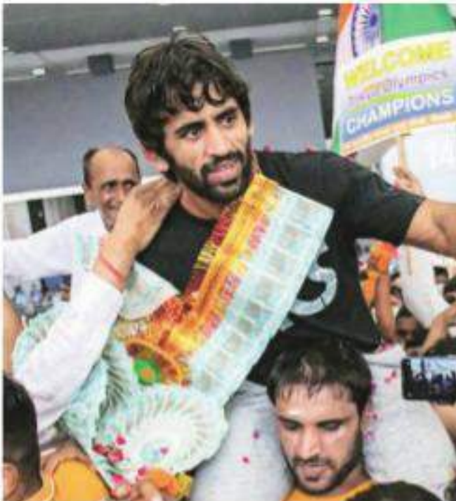
बजरंग पूनिया - कांस्य पदक विजेता