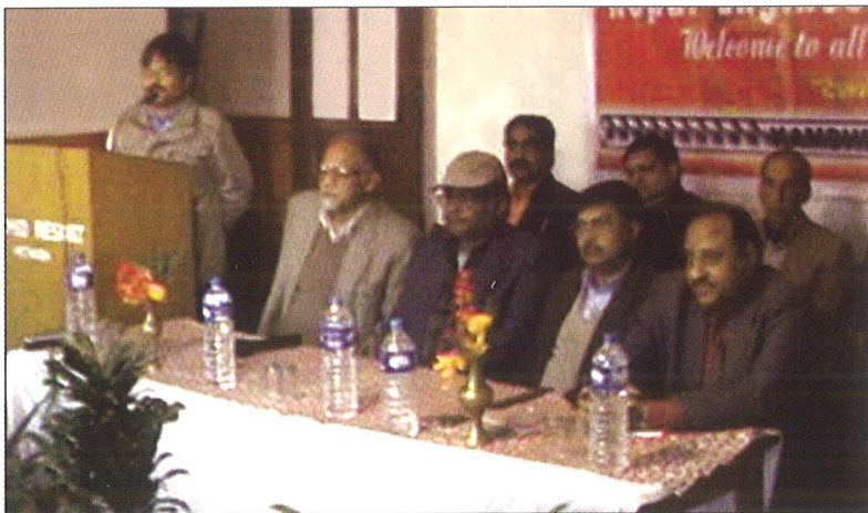
Officials of Kamdhenu Ispat Ltd. and Maruti Nandan Steel Rolling Mills along with Engineers during the Engineers Meet

KAMDHENU Ispat Ltd.'s Nepal venture with Kamdhenu brand TMT steel in association with Maruti Nandan Steel Rolling Mills has witnessed consolidation of the major TMT markets of the country. The Company held an Engineers' Meet at Hetauda on 21st Jan in association with Hetauda